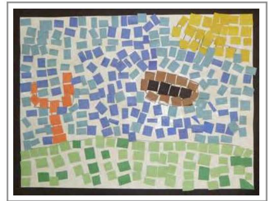
Jack Fitzgerald 1 st Grade