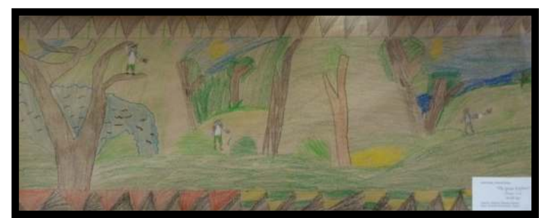
Caleb Kang, 2nd Grade, "The Great Explorer"